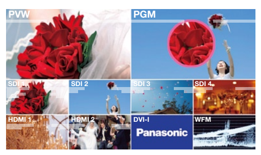
Multi-View Screen (simulated image)